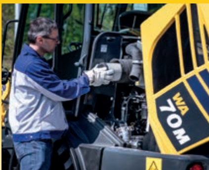
Fast, easy and comfortable access to daily inspection points