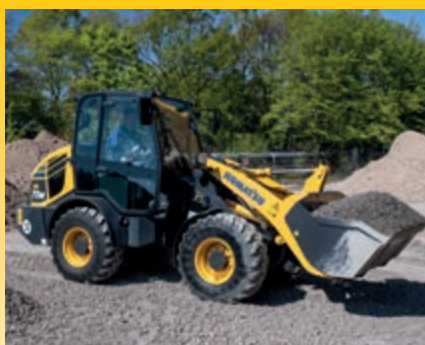
Electronically controlled suspension system load stabilizer (ECSS) (option)