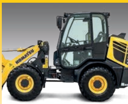
Low total height (2,48 m) for easy transport