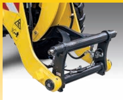
Electrically actuated quick-coupler for fast and easy change of attachments