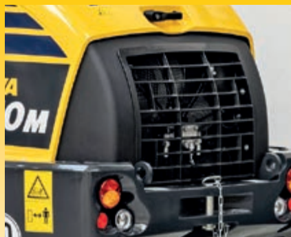
Wide core radiator with (optional) reversible fan