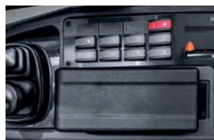
Improved, ergonomic control elements