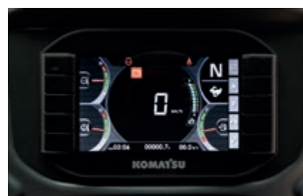
Large multi-function monitor

The user-friendly multi-function colour monitor with Equipment Management and Monitoring System (EMMS) supports safe and smooth work. Eco-gauge and an Eco guidance with active recommendations help maximising fuel savings. The monitor is conveniently customisable with a choice of 24 languages.