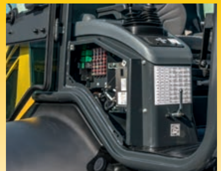
Side cover for quick maintenance access